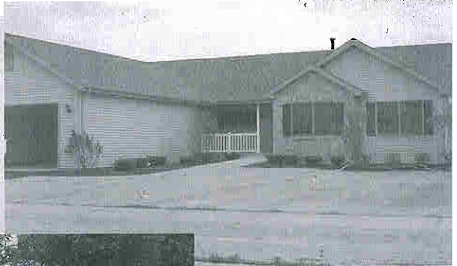
3615 Shattuck Lane

The Javelin home, which opened in 1983, was the first community living facility in Rockford and also was the