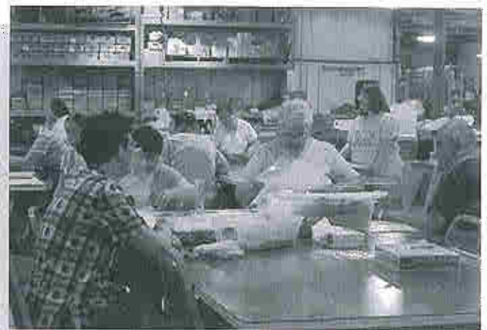
Teamwork gets the job done.

Milestone, Inc. is a 501(c)(3) Illinois not-for-profit organization. Milestone Matters is developed to inform the public of the programs and services we offer to the developmentally disabled citizens from the greater Rockford area. To learn more about Milestone and the individuals we serve, please call (815) 654-6100.