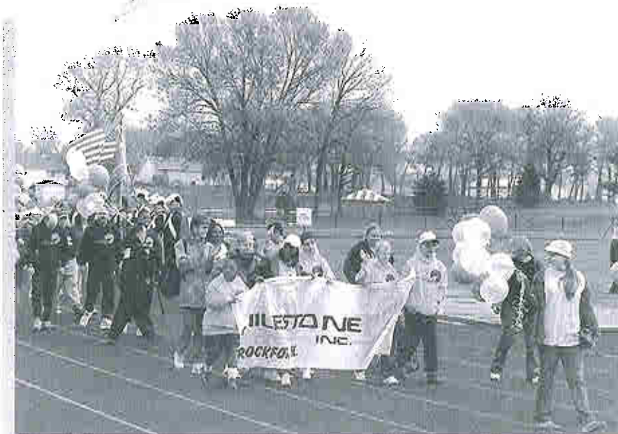
Athletes from Milestone, Inc. proudly march in the parade of athletes at the annual Track and Field meet.

Later in March Milestone was represented with 2 teams at the State Basketball tournament in Bloomington. Both teams won third place honors. Five individual basketball skills' athletes also took part in the competition and each brought home a medal.