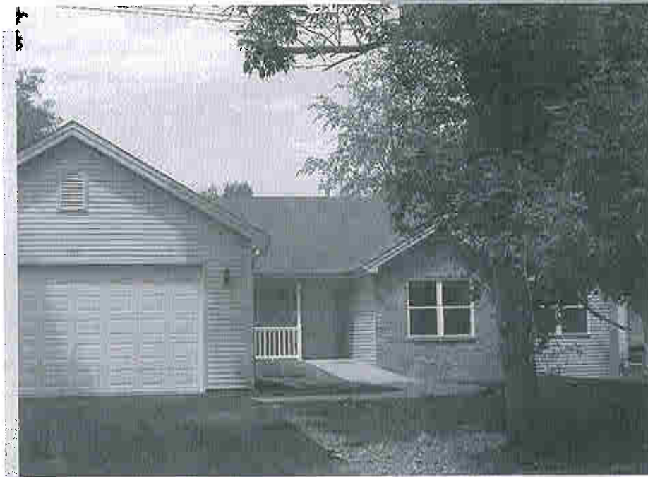
1307 Geneva Avenue

Riverside opened in 1996 and is also being replaced by a newer, more home-like setting. A total of 13 individuals from Javelin and Riverside will be relocated into the three five-person group homes. Two young adults who are aging