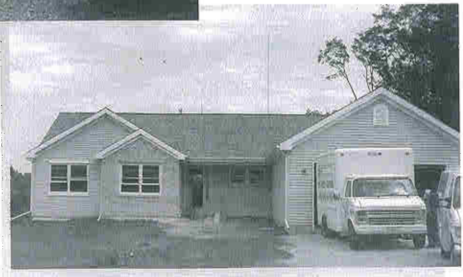
5142 Hermitage Trail

out of RocVale Children's Home will also be moving in, bringing the total number of individuals to 15 in the three group homes. It's an exciting time for these young men and women and their families.