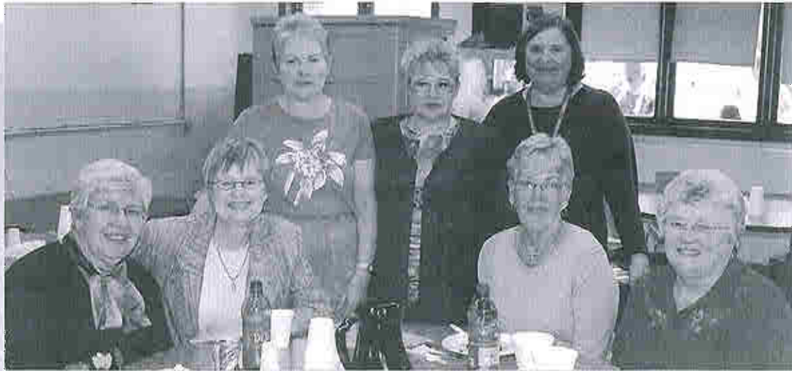
Some members of the Human Rights Committee gather after the May luncheon.