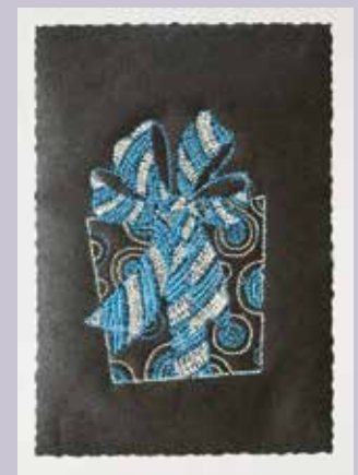
The Present is a Gift