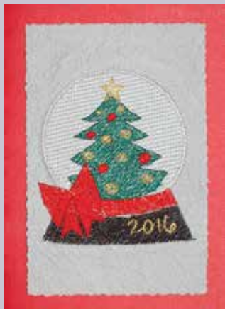
Snow Globe 2016

Last year was a record setting year with MILESTONE Industries filling orders for over 7000 cards, so please order yours early.