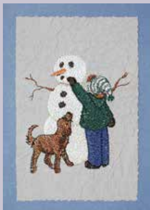
Winter Afternoon Friends