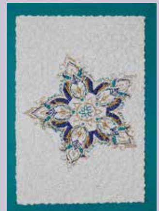
Star of Wonder