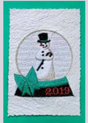
Dapper Snowman Sam 2019