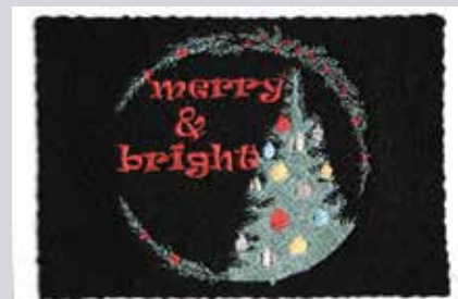
Merry & Bright