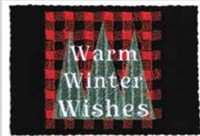
Warm Winter Wishes

Last year was a record setting year with MILESTONE Industries filling orders for over 7,000 cards, so please order yours early.